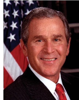
George W. Bush